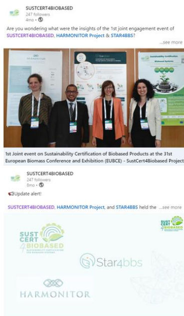
Figure 2: Cluster events disseminated through social media networks

All three projects work under the same vision and contribute to a faster green transition! Stay tuned to find out more about our joint events and activities!!